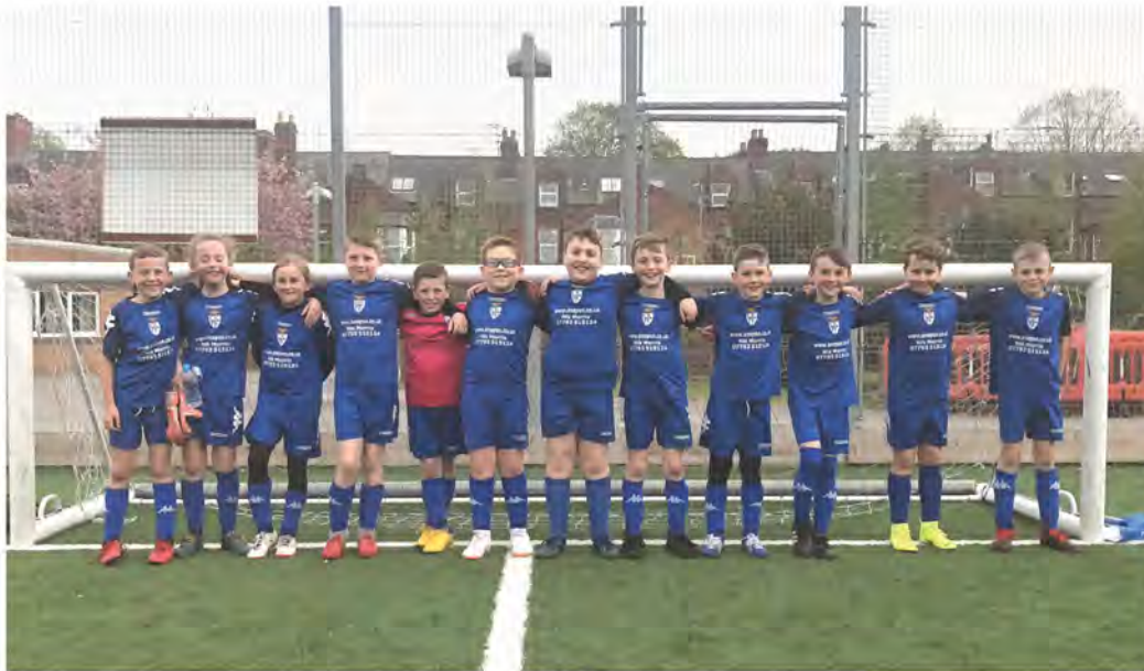
The Under 9s Team

Next season we will have teams playing from u7 to u11 in the Longhorn League and u12 and u14 in the Penrith League and possibly additional teams/players, so we now have over 100 players from u6 to u14 playing for the club.