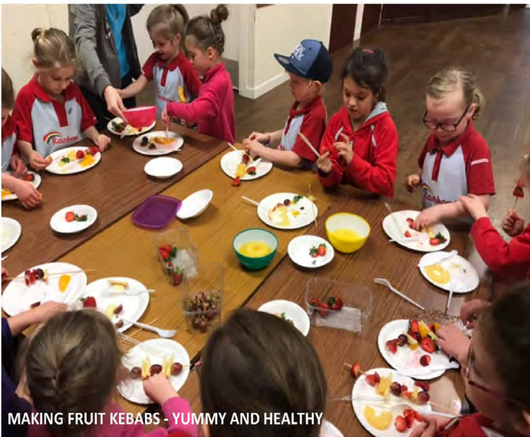
MAKING FRUIT KEBABS - YUMMY AND HEALTHY

The Rainbows will have a stall at this year's Summer Fair on Saturday 29th June so please pop along and say hello. The following weekend will see our Summer Trip to Hawse End which the Rainbows and Leaders always enjoy.